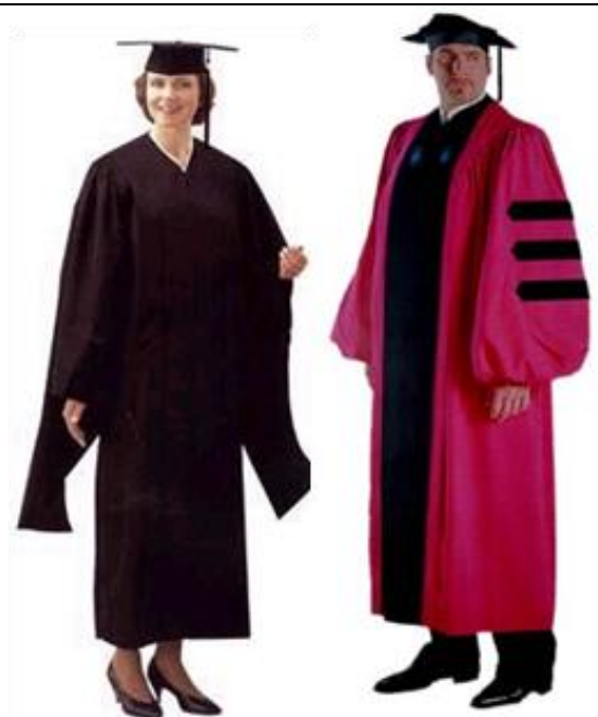
MASTER OUTFIT $229.00